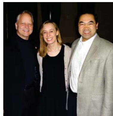
NASBS Members enjoy the social events during the meeting.