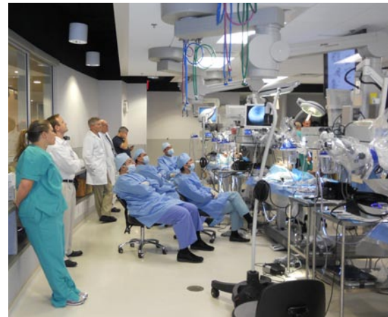
NASBS Course participants (in surgical gowns), along with faculty and staff, view a demonstration on overhead monitors in preparation for surgical exercises.