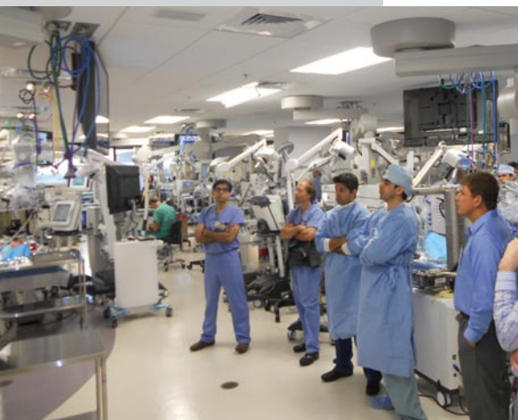
Course faculty and participants watch an in-lab lecture on surgical technique, prior to hands-on dissections.